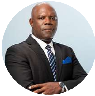
Immediate Past President