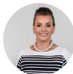
Sergeant at Arms