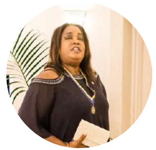
Vice President/Club Admin