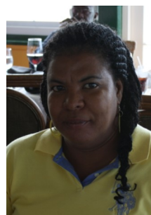
Margaret Delmar Club