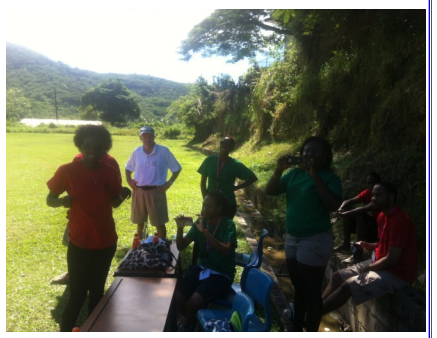
Visitors and guests at this meeting