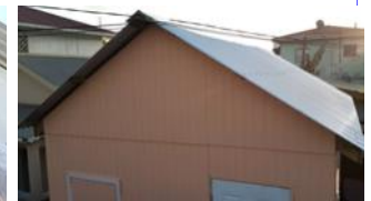
....work on the shower started