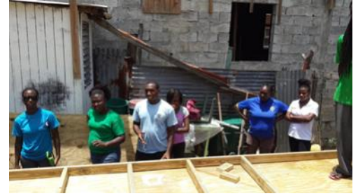
In no time the side panels were cut and assembled