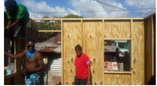
...the roof was framed and up it went