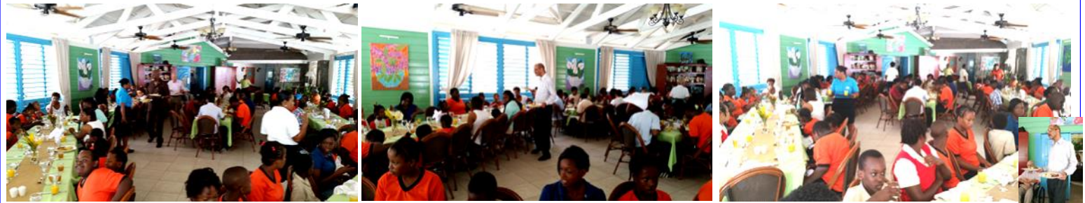
....Rot. Andre and Phillip not allowing to be outdone

It is also a Rotary Club of Saint Lucia tradition to pass around "Chester's hat" and for Rotarians to make personal donations.