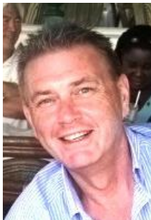
Richard Curtis United Kingdom