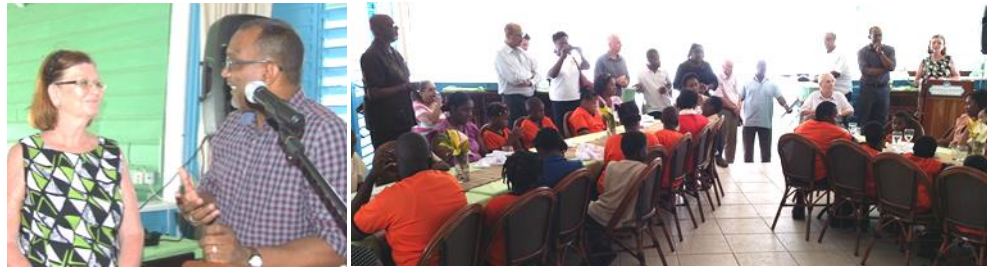
It is fair to say children, teachers, Rotarians and friends had an all around enjoyable lunch....

The amount will be matched with a donation from the club's charity funds.