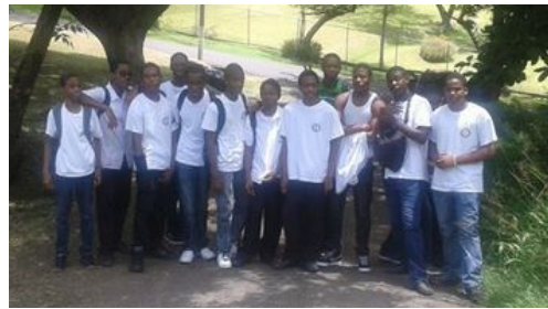
Very important, the glue holding together every club—fellowship