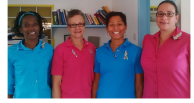
The ECDC Team