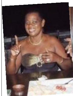
I have an eye on you