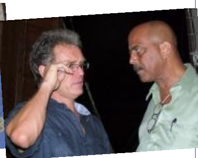
You paid how much???