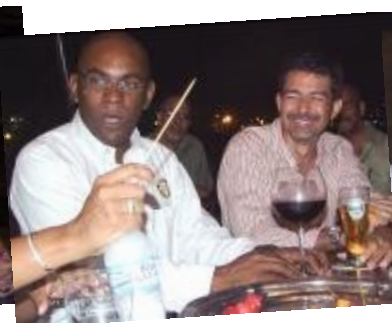
You don't say?