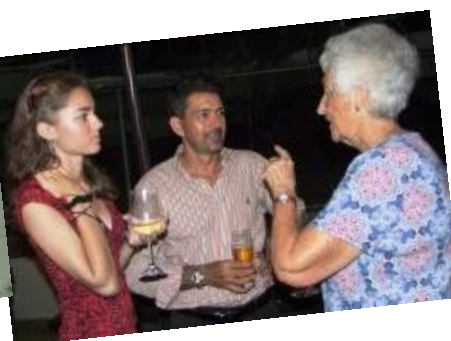
I am telling you I know that house