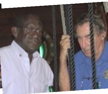
Stay calm, I know a way out