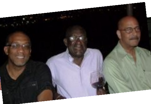
It wasn't us