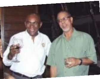
Naah, I don't think so