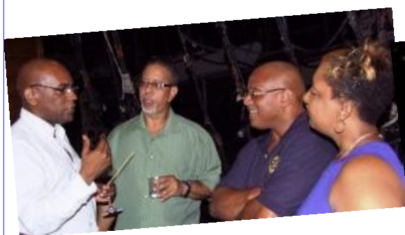
Let's take that ship to Martinique right now