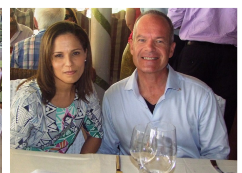
Several Rotarians brought their spouse for lunch