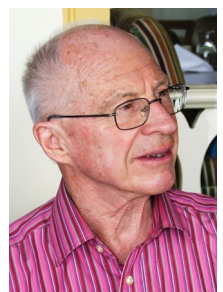
3 x PP Sten Andersson RC Stockholm