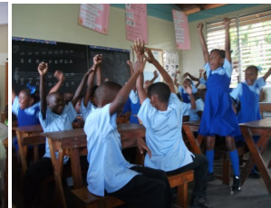
Mon Repos Primary