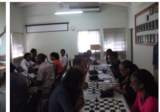
Dist. 7 Teachers Workshop