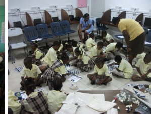
Grand Riviere Primary