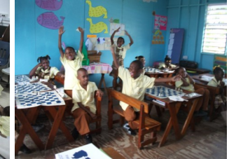
Aux Lyon Combined