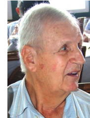
a joke from Pedro