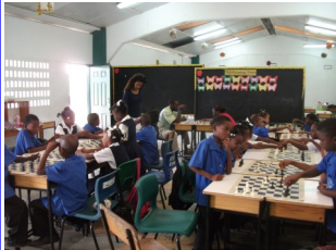
Anse La Raye Primary