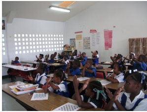
Ti Rocher Combined

The chess program has now reached cross roads and will not continue in it's current form in the new school year. These are schools that had a fairly active program but represent a small minority.