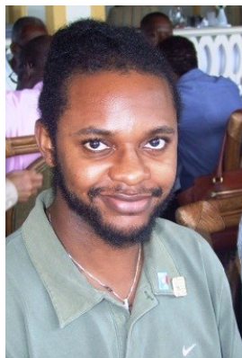
Rotaract President Ever visited to promote The clubs Christmas fundraising activity on December 14, 2013 at Oceanview Restaurant