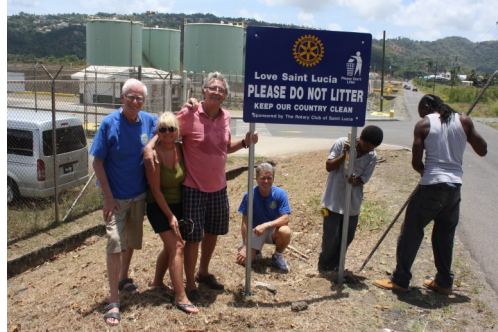
...and finally the successful placement of the signs