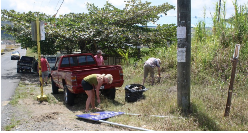
Job number 1 was to pick up the garbage in the vicinity of the signs

After several setback like the signs designed incorrect, poles missing and of course the best - the signs being torn up by dogs - the project was finally completed and the signs now adorn the roadside in Cul de Sac.