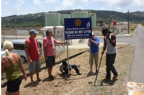
...before we all watched as the signs were being planted.