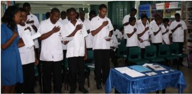
Members reciting the Interact pledge

The students were reminded that despite Rotary's support and assistance it is important that the club was self-governing and self-supporting. Through their efforts they will learn the importance of developing leadership skills and personal integrity, demonstrate helpfulness and respect for others while understanding the value of individual responsibility and hard work as well as advancing international understanding and goodwill.