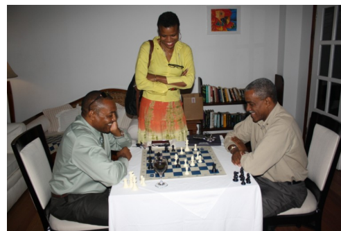
Is Pres Diddy already challenging Master Albert?