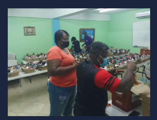
Behind the Scenes of