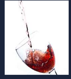
Wine & Cheese