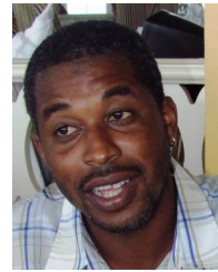
and Shaggy Isaac

More pictures from the launch of the Rotary water project As reported on several TV stations on Tuesday December 11, 2012