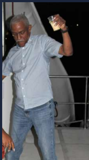
MOVES LIKE JAGGER

Who knew this Rotarian could move like this??!