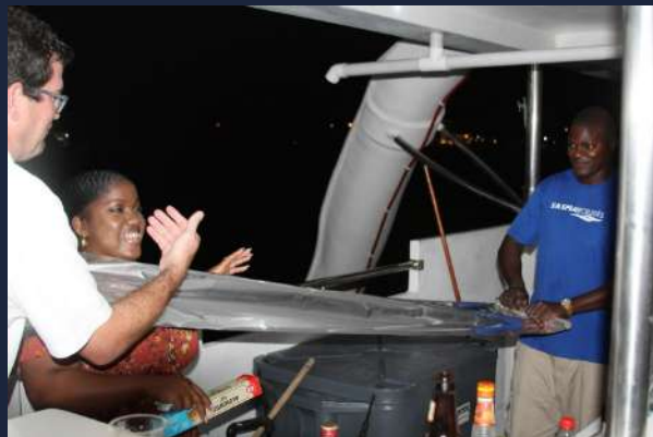
HUMAN SANDWICH ANYONE

Look at Rotarian looking like a picture of utter bliss ... He who finds a wife finds a good thing...Clearly!