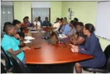
Skype meeting with Milton Rotaract Club Canada

World Rotaract Week March 10-16, 2013 activities by the Rotaract Club of Saint Lucia