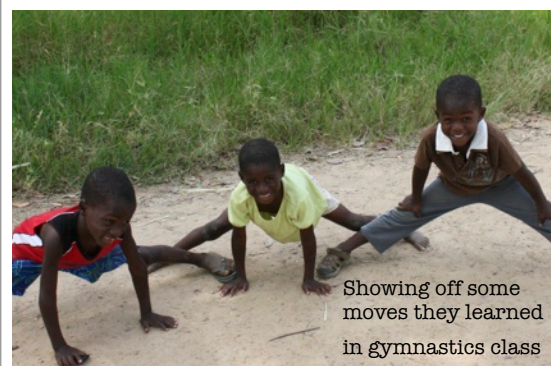
Showing off some moves they learned in gymnastics class