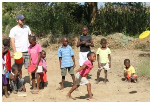
Disc golf at the village