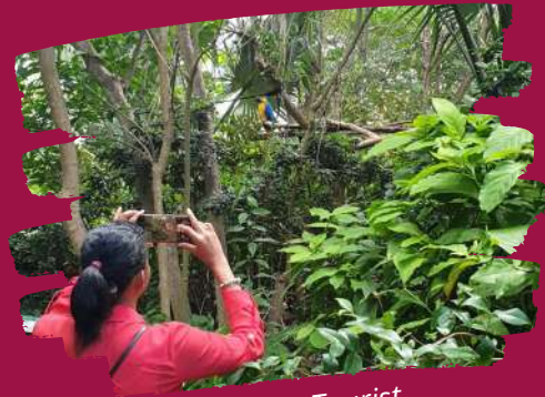
~ Being a Tourist