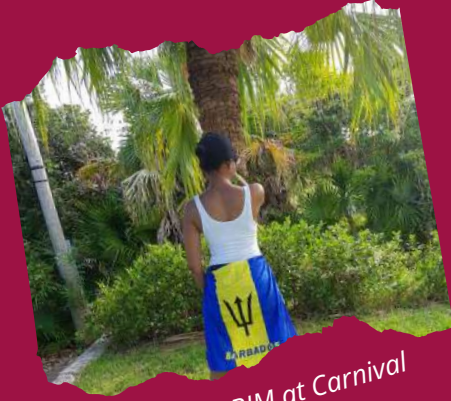
~ Reppin' BIM at Carnival