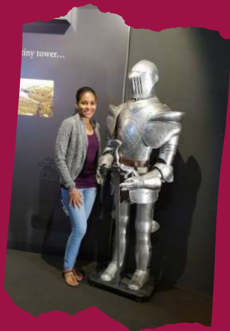
~ Visit to Fort St. Catherine