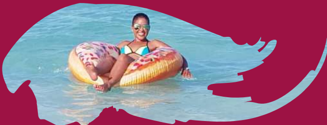
~ Chilling at the Beach