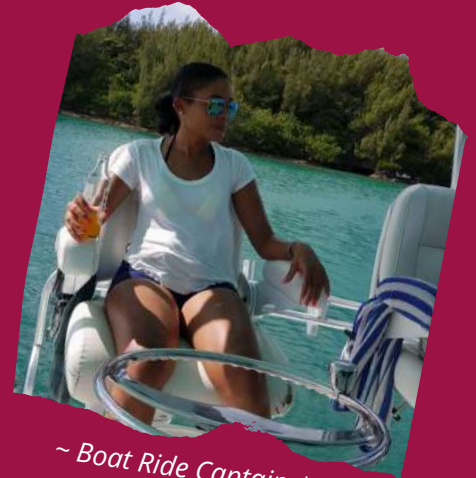
~ Boat Ride Captain :)