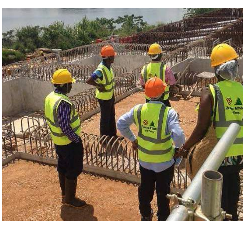
ABOVE: Vocational Tour of the Nile by RC Kampala Central