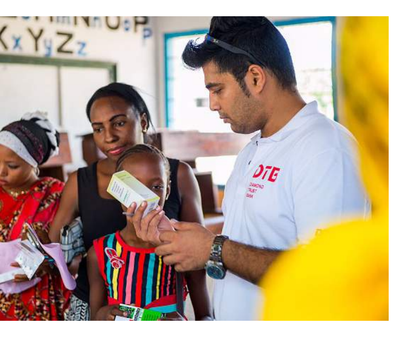
ABOVE: Msasani Primary School Students Receive Medical Care from RC Oyster Bay