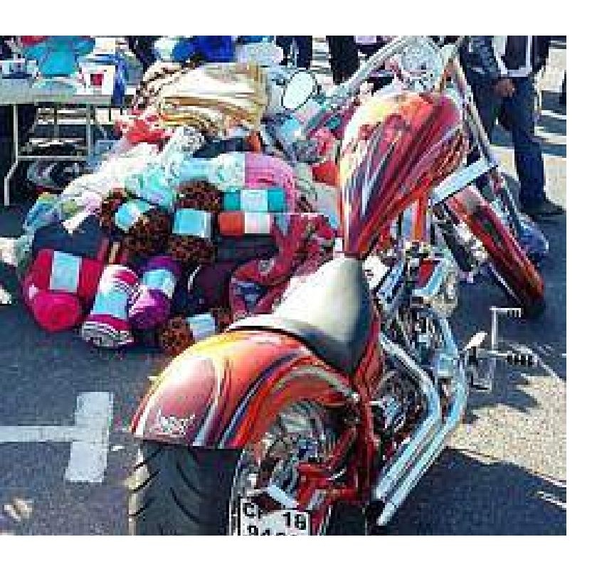
ABOVE: Biker Blanket Donation RC Blouberg Cape Town