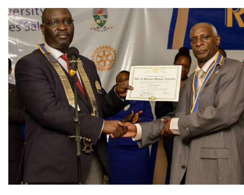
ABOVE: New Club Charter Ceremony for RC Mlimani in Tanzania