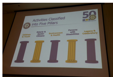
ACTIVITIES CLASSIFIED INTO FIVE PILLARS

A 50th Anniversary Logo was devised. See copy at right