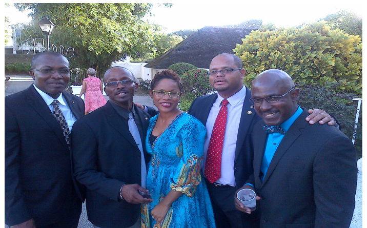
PE and part of his team at the Senior Citizen's party held December 10 th 2013.

The District Governor's report on Membership Mobilization revealed that the club has had a 1% growth in membership over the past 3 month interval. Membership was 84 in July 2013 and has increased to 85. The District Governor revealed a plan for membership mobilisation including the steps intended to be implemented by individual clubs to reach the goal of increased membership of District 7030 to 2,450 members in 70 clubs and retention of 95% of members.