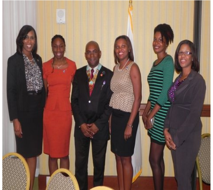
The District Governor with Rotaractors.

Subsequently, membership was divided into two categories the active and the honorary.