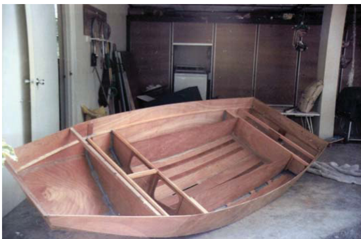
Building a Mirror dinghy in someone's garage.