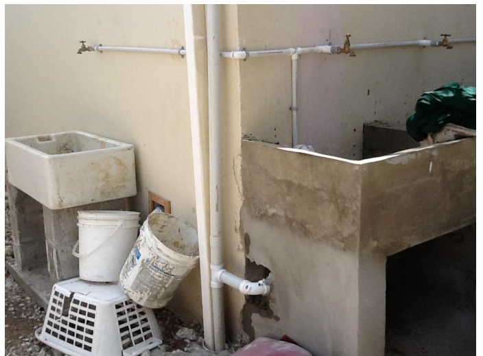
Photo of smaller sink which was also donated