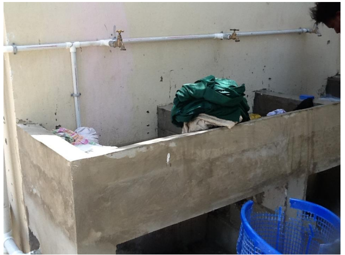
Three compartment concrete sink which was constructed