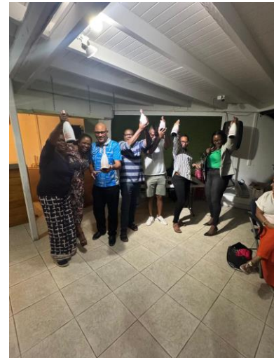
Congrats to the winning team ‘Last Place’