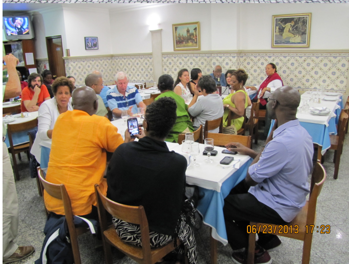
Rotarians enjoying fellowship at the 104 th Rotary International Conference in Lisbon, Portugal (2013) © PHF VP Elvin Sealy.

The 2014 Rotary International Convention will be held in Sydney, Australia 1-4 June 2014.