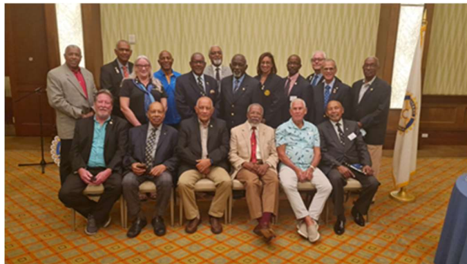
The Past Presidents that were present at the meeting