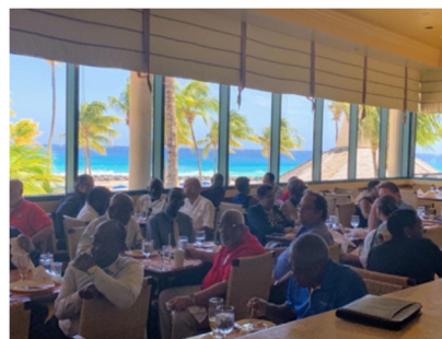
Left: Meeting Attendees