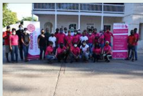
The Rotaract/RCOB family after completion of another successful initiative.