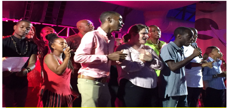
The Pupils, Performers & Some of Our Guests

Please read the full story in Tuesday, April 11th’s Daily Nation, or in the eNATION edition.