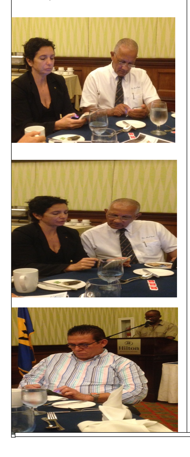
Members paying rapt attention to the meeting on February 6<sup>th</sup> 2013.