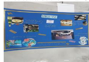
One of the vision boards