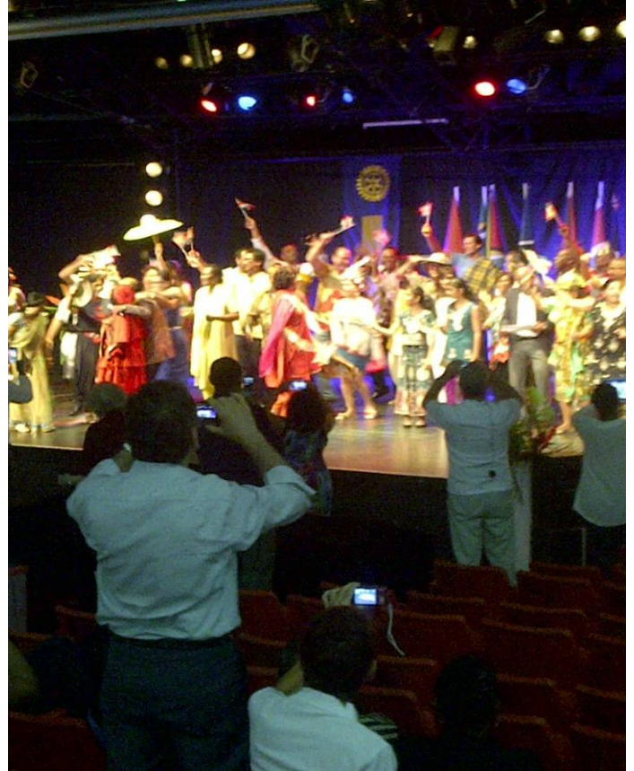
Selling the 2015 Conference – Surinamese Cultural Presentation