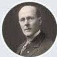
Paul Harris Rotary Founder

“I would like to think that the pioneering days of Rotary have only just begun. There are just as many new things to be done as ever there were. Kaleidoscopic changes are taking place, many of them without our will. Even to hang on to the fringe of this fast-changing world is about all most of us can do. Rotary simply must continue to pioneer or be left in the rear of progress.”