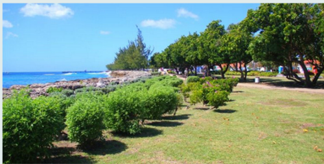
Trevor's Way – A Rotary Club of Barbados Environmental Project circa 1975/76