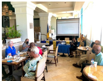
Club members in the audience at the live session