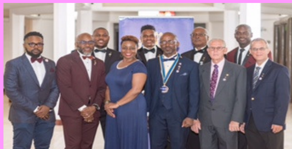
The Head Table