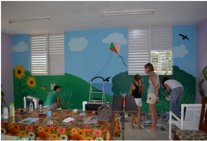
Here the Campers are working in painting a large mural in the women's meeting room of the District Hospital.