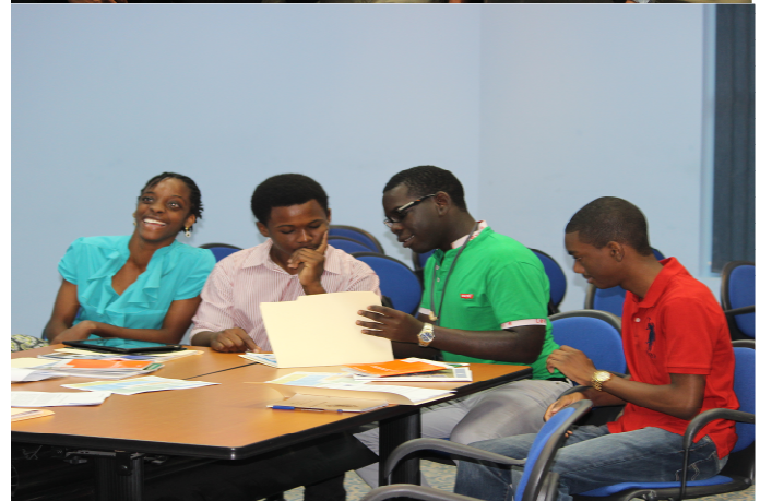
Attendees (above photo) and participants at the Mun Launch and Training Session.