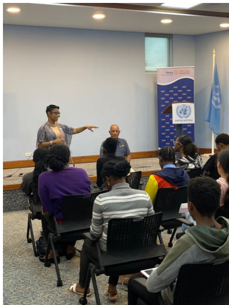
Session 4 in progress

Students act as representatives from different countries and together seek resolutions on relevant issues. It is an extraordinary opportunity for students to become immersed in the workings of a multilateral environment.