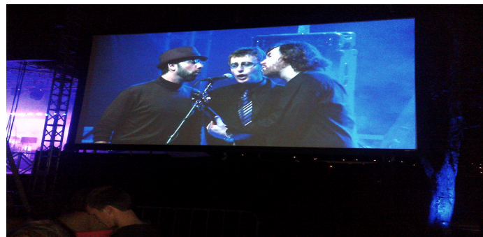
AUSTRALIAN BEE GEES TRIBUTE

Also note the article Musical Magic in the Daily Nation – Monday March 17 –Centre Pages and page 40 and A Blast with the Bee Gees! Barbados Today – March 18