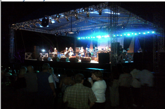
Brass Soul - FIRST ACT ON STAGE

“Both Brass Soul and the Bee Gees were very pleased with the show. The Bees Gees who are accustomed to doing “gigs” said that this was unlike anything they have ever done and it was no “gig” it was an event. We had approximately 1,500 patrons at the show. Many patrons commented on the fantastic infrastructure of a well planned event and congratulated the bands and Rotary for a job well done”.