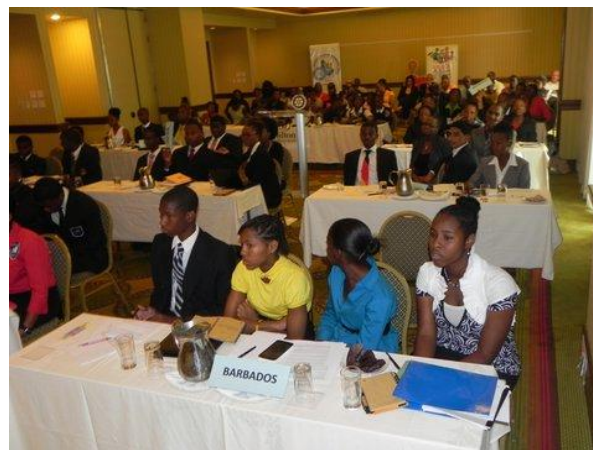
Student delegates at Plenary session.