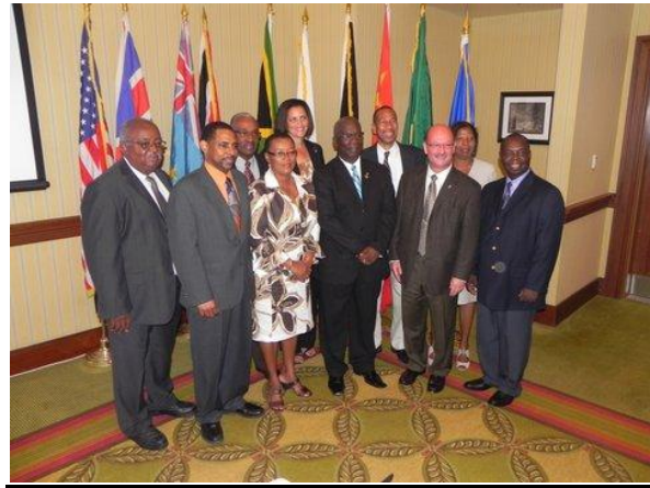
Group photo with Minister of Foreign Affairs, Minister of Education, UNPD Rep. 3 Rotary Presidents & 4 Secondary School Principals At the opening ceremony.