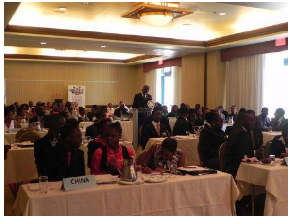
Student delegates at plenary session.