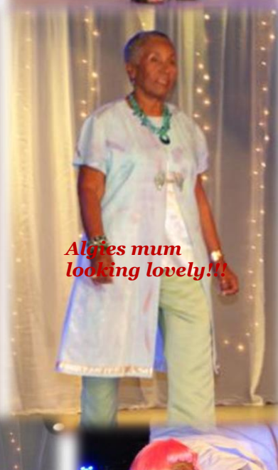
Algies mum looking lovely!!!