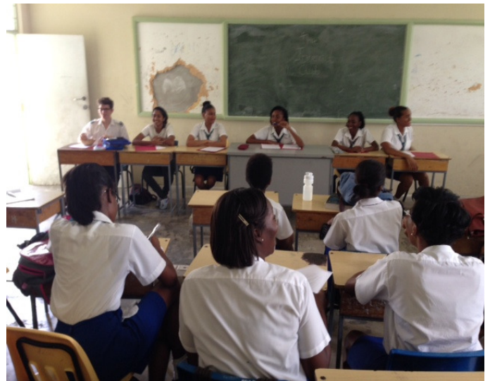
Interact members hard at work.