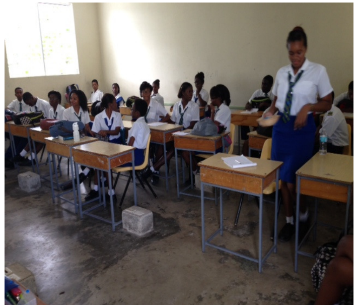
Interact Meeting in full swing.