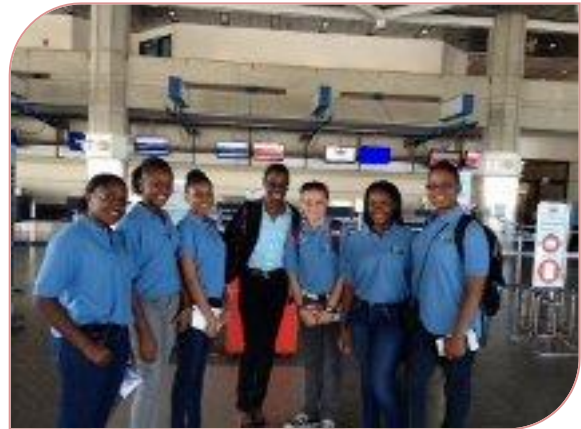
The students at the Grantley Adams International Airport going off to RYLA on October 17 th 2013.