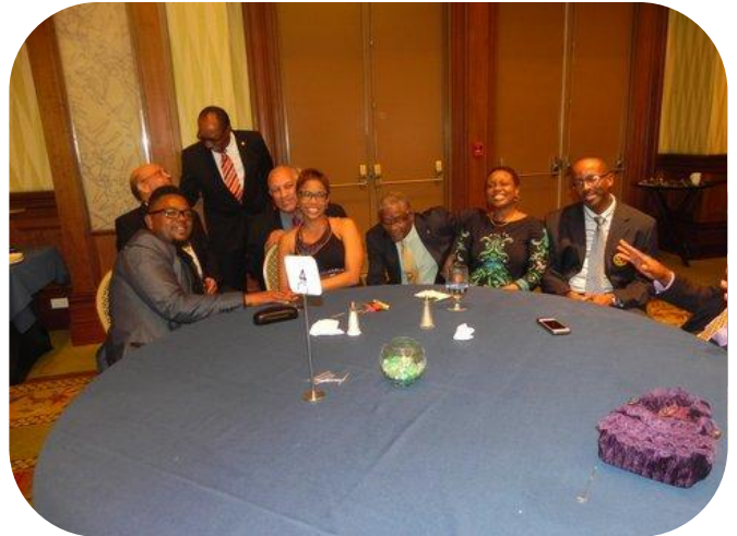
Members of the Club enjoying the evening.