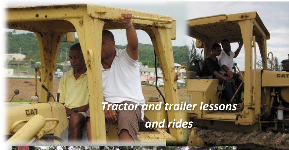
Tractor and trailer lessons and rides