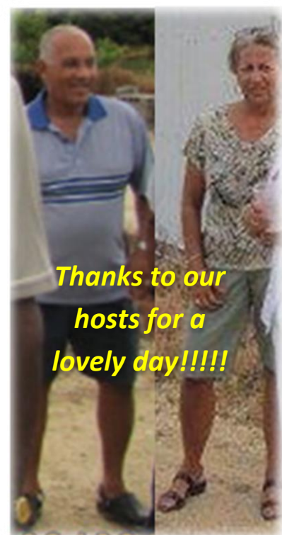
Thanks to our hosts for a lovely day!!!!