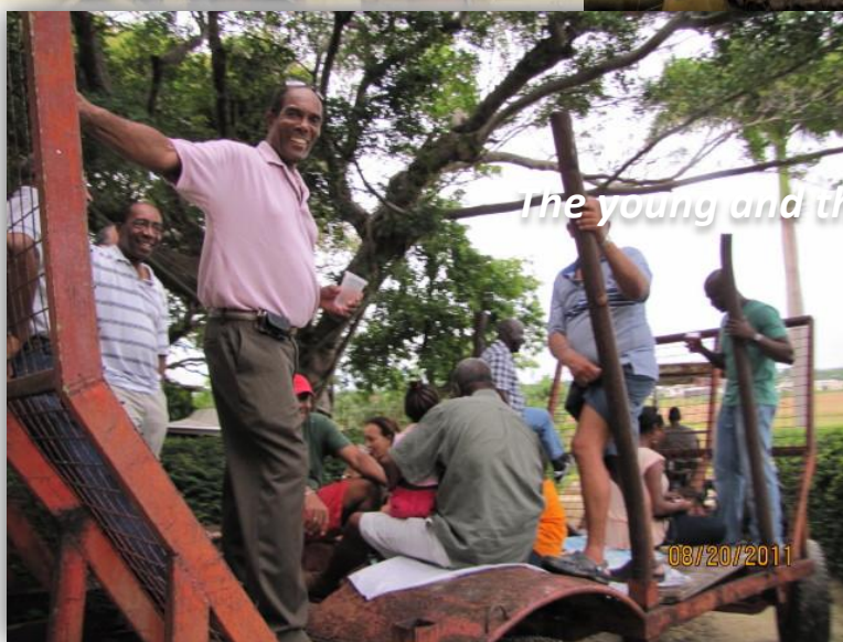
The young and the not so young all enjoyed the day!