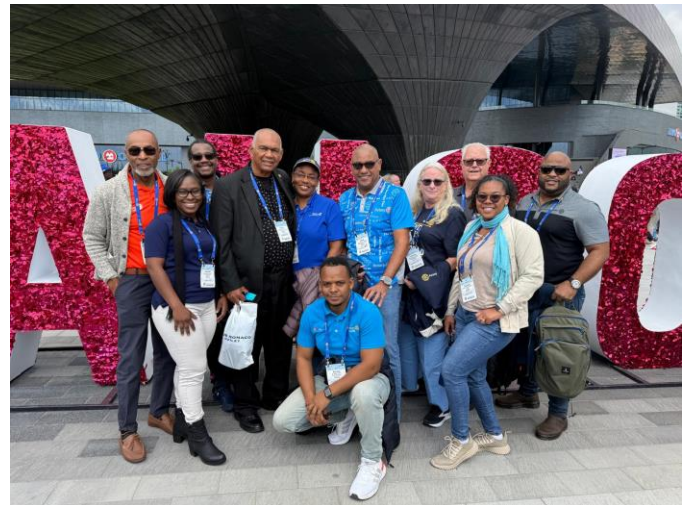
Barbados in the house!