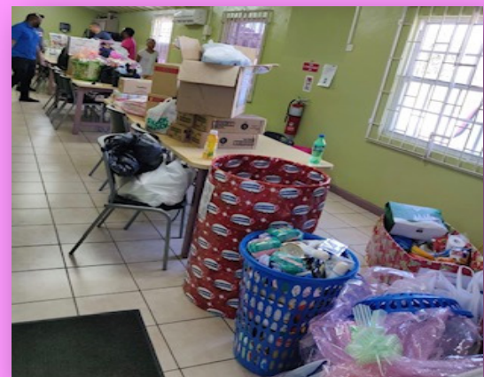
Above: Rotagift—the Rotaractors gift collection drive.