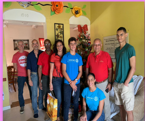
Above: A smiling gift distribution team.