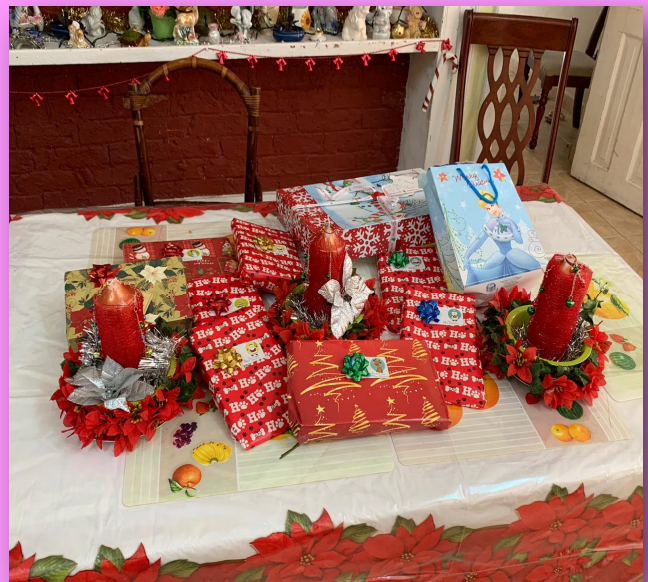
Above: The Sterling Children gifts.

The final Rotary gift distributions for the year took place on December 21 at the Sterling and Farris Children homes.