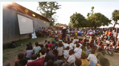
Rotary grants support community events to educate people with albinism in Tanzania.

Headed by a local Rotarian Community Advocate who is also an albino, campaign for the right per of people with albinism which are often misunderstood. With the assistance of Tanzania based Rotarians and two global grants "Vision Aids and Albinism Awareness to Children in Tanzania " the lives are changing for the better. Under Vision Aid grant, optometrists from Scotland train local optometry students.